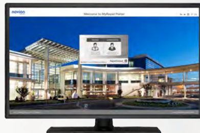
Branded login screen designed to suit your company profile.