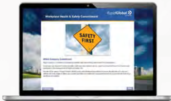
Editable induction and training courses.