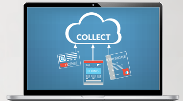
Collect certificates and licenses from trainees