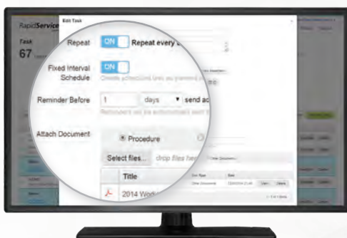
Schedule Task Reminders and Alerts